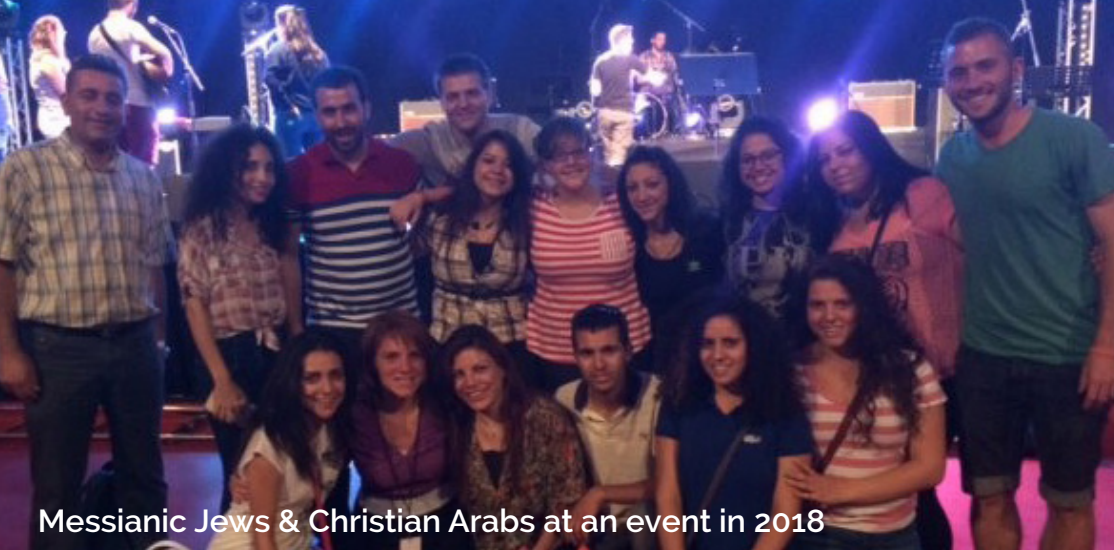
Messianic Jews & Christian Arabs at an event in 2018

During this expedition you will have the opportunity to meet Messianic Jews and Christians in various communities.